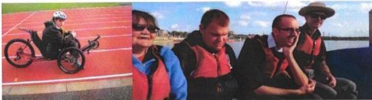
On wheels and on the water: members of our ActivEyes group

Providing specialist support to anyone with a visual impairment in Oxfordshire